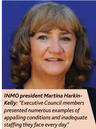
INMO president Martina Harkin-Kelly: "Executive Council members presented numerous examples of appalling conditions and inadequate staffing they face every day"

"In their examination of the latest proposals, Executive Council members presented numerous examples of nurses and midwives unable to provide full care to their patients, working beyond the end of their shift without pay, unable to take meal breaks and facing unmanageable workloads because of the appalling conditions and inadequate staffing they now face every day," said INMO president Martina