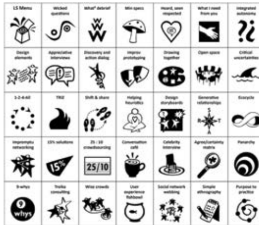
Liberating structures menu

Liberating structures encourage us to discover a vast reserve of contributions and