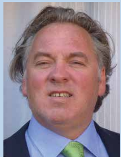
Dr Paul De Raeve, EFN general secretary, and author of European Union – what’s in it for me? Dr De Raeve also represented the 35 national nursing associations at a recent OECD Policy Forum

As a key player at EU level, the EFN will follow this OECD debate closely and will question the contribution of the European Commission to make sure health systems are more people-centred and give more